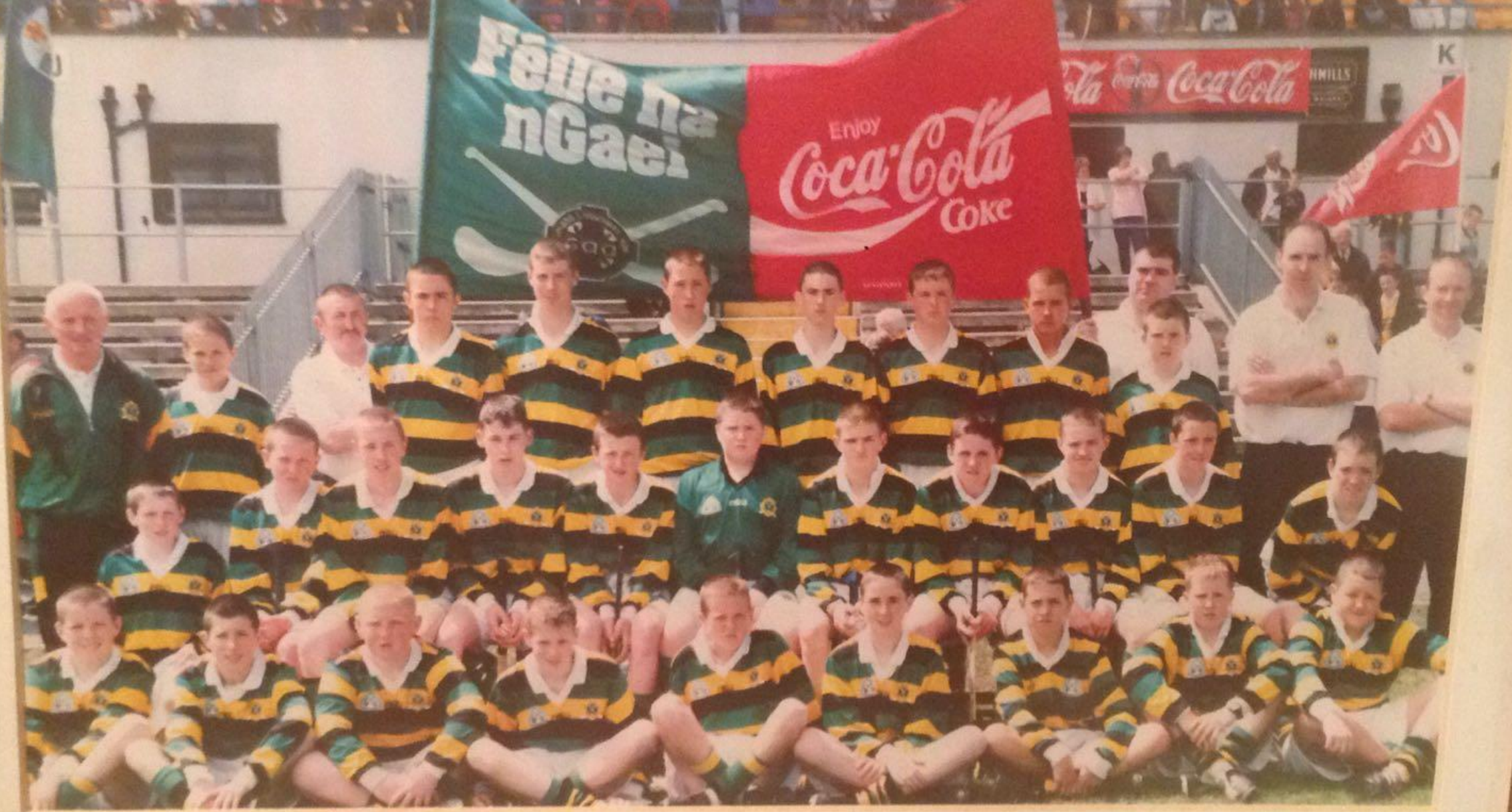
ALL IRELAND FEILE CHAMPIONS